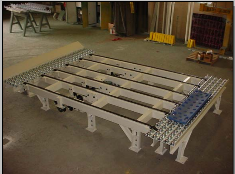
Chain on Edge w/ Transfer Tables