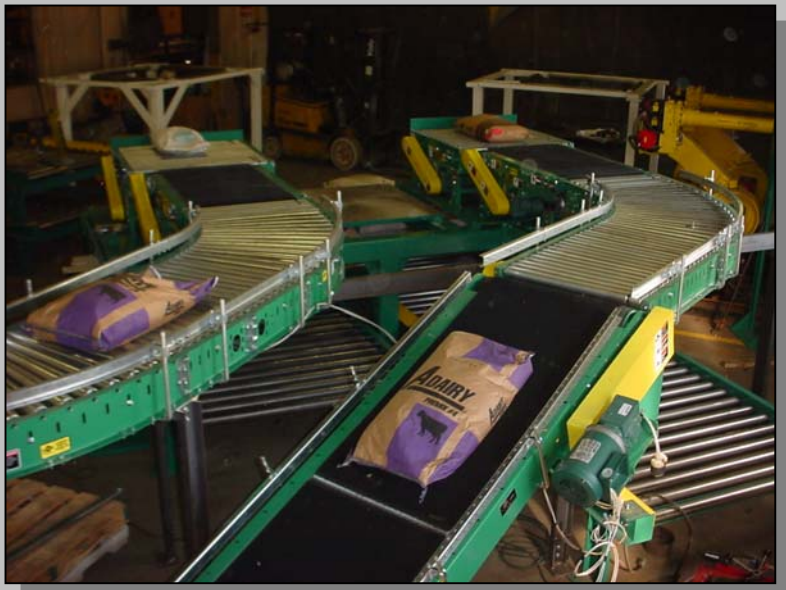
Bag Conveyor Systems