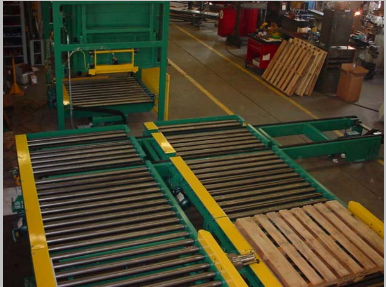
Pallet Transfer System