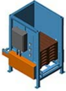
Straight Through Discharge