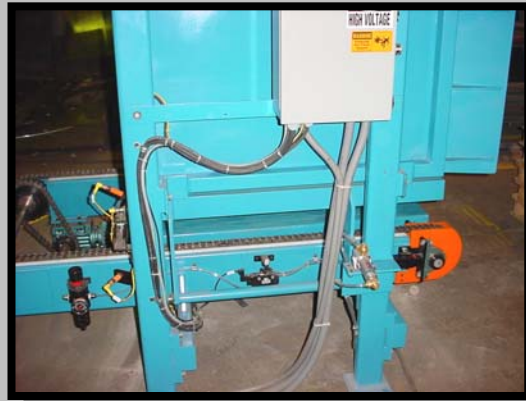
View Of pallet chain on edge conveyor