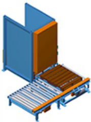
Right Angle Discharge